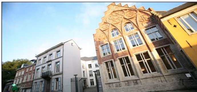
Faculty of Economics and Business Campus Leuven - Restored historical facade

Studio: private kitchen and bathroom, furnished. Average price: between €480 to €600 per month.