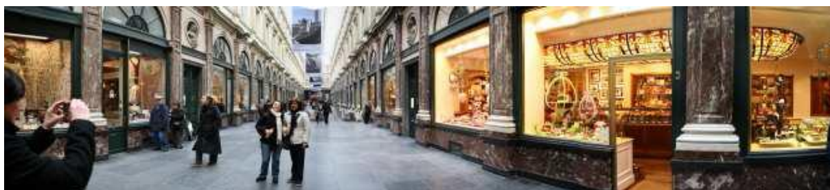
King's Galleries Brussels

Rue du damier 23 1000 Brussels T: +32 2 218 50 50 F: +32 2 218 13 13 mailto:info@sleepwell.be