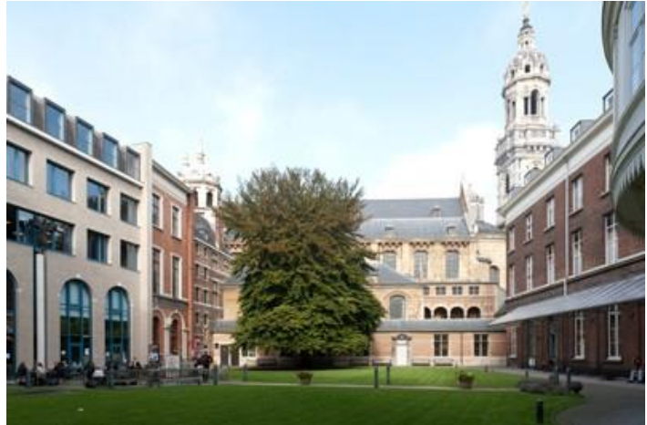
Faculty of Economics and Business - Antwerp Campus