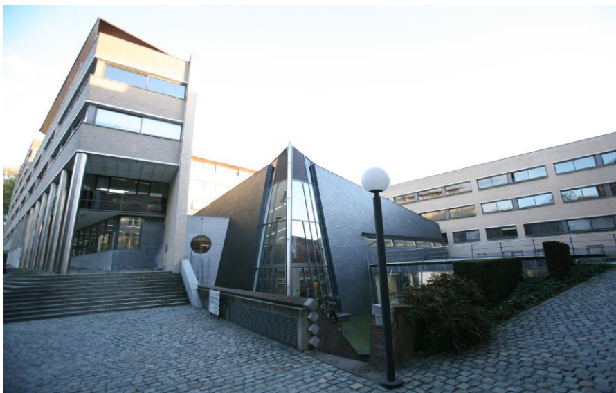
Faculty of Economics and Business - Leuven Campus