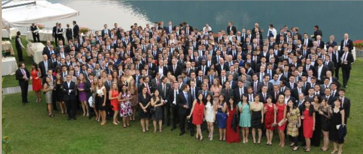
2012 INTERNATIONAL TRAINING WEEK (ITW), MILAN