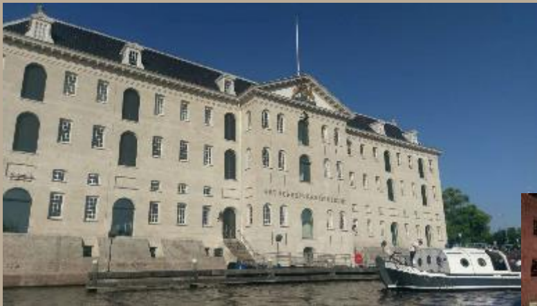
2016 ITW, AMSTERDAM