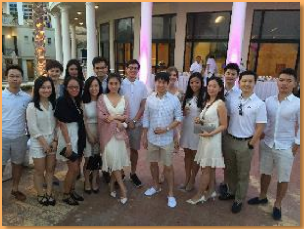
AWAY WEEKEND, MALTA