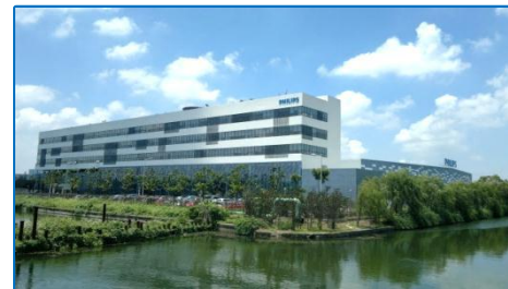
Philips Healthcare Suzhou