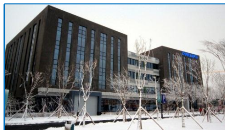
Shen yang Branch, Philips Healthcare Suzhou